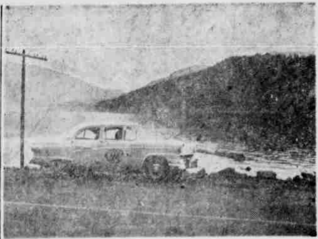
Detroit lake, newly created by Detroit dam on North Santiam river, is fast becoming public playground. View across lake of Mt. Jefferson tempts travelers in white AAA car to stop.

Snider has 53 fishing boats, motors for 12 of them. He berths a few cruisers and is planning ahead for the expan-