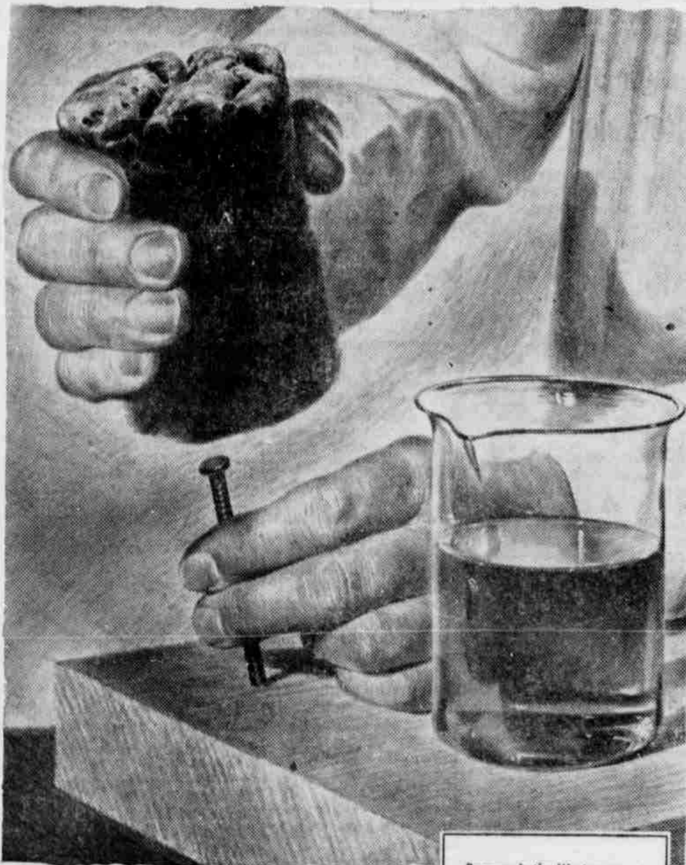
During exposure to atomic radiation, some petroleum oils are turned into solids, hard enough to drive a nail, useless as a lubricant

BY 1975 the world will use nearly twice as much energy as it does today—and atomic power will be needed to supply part of the growing demand. Helping develop this new power, Standard research teams have been working with the Atomic Energy Commission on many projects during the past 10 years.