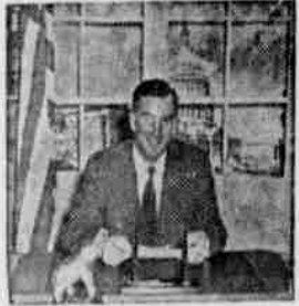
Congressman SAM COON WASHINGTON, D. C.

SEVERAL DAYS of heated debate have taken place in the House on proposed civil rights legislation. The bill would set up a civil rights commission to investigate complaints that citizens are being deprived of their right to vote, or that they are being subjected to economic pressure because of their race, color, religion, national origin or sex. It also proposes changes in the civil rights laws and in the legal procedure in some of these cases.