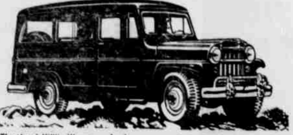
The 'Jeep' Utility Wagon... dual purpose vehicle for business and family.