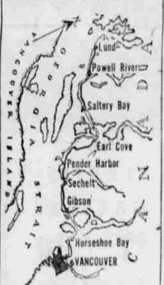
Map shows combination of road and water routes linking Vancouver, B. C., north coast.

Fishermen can bring their boats and motors with them, but they needn't. Seaworthy small boats equipped with air-cooled inboard motors are available for rental at reasonable rates all along the peninsula.