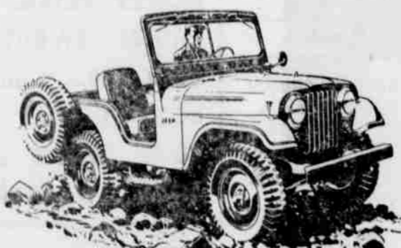
The Universal 'Jeep'... does hundreds of jobs.

It's good insurance and good business to own a vehicle that will help you get more work done every day in the year—that's a 'Jeep' 4-Wheel-Drive vehicle. On the highway, it travels at road speeds in 2-wheel drive—a simple shift gives the extra traction of 4-wheel drive for rough travel, on or off the roads. With power take-off, these rugged vehicles operate many kinds of special equipment. There's a 'Jeep' vehicle that will fill your specific needs and serve you best.