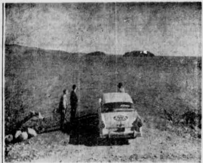
Gower point, one of many spots on "Sunshine coast" where salmon abound, is pleasant pause for white motorlog car.

A pleasant 15-mile trip along Marine drive, which winds through a lovely shoreline residential district, ends at the ferry slip at Horseshoe bay.