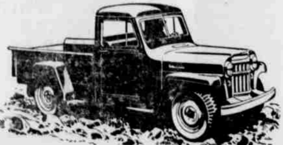
The 'Jeep' Truck... America's lowest-priced 4-wheel drive truck.