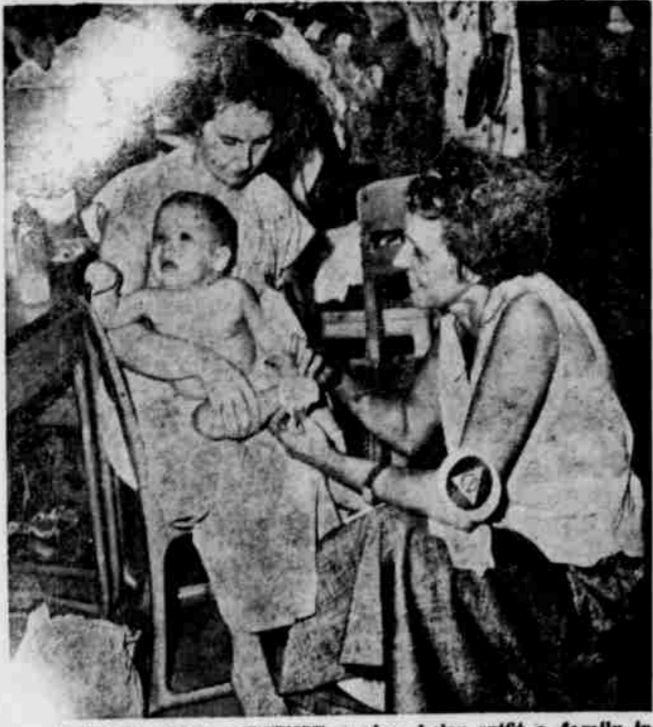
Volunteer CIVIL DEFENSE worker helps outfit a family in shelter in Torrington, Conn., after all the family's possessions were washed away during the Northeast flood caused by Diane. Working with the Red Cross, civil defense Welfare volunteers helped alleviate human misery just as they did if this nation were suddenly attacked.