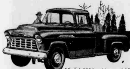
Model 3204 - 1/2-ton, 90" box