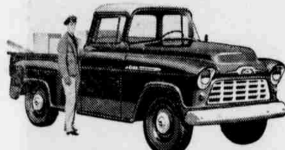
Model 3104 - 1/2-ton, 78 1/2" box

Under the hood you've got Chevy's famous Thriftmaster 6 engine, the work-horse of the industry! Or, optional at extra cost, an ultra short-stroke V8. You get Ball-Gear Steering, High-Level ventilation, concealed Safety Steps and Work Styling! You get a grain-tight tailgate, flat-fledged side panels and a low platform for easy loading! Stop by for details on today's best Pickup buy!