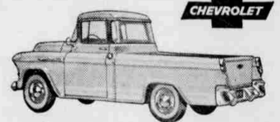
Cameo Carrier - sharpest Pickup on the road!