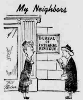
"This is it, Aggie—where all our money goes!"