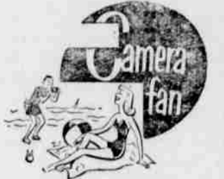
Photo Developing SERVICE