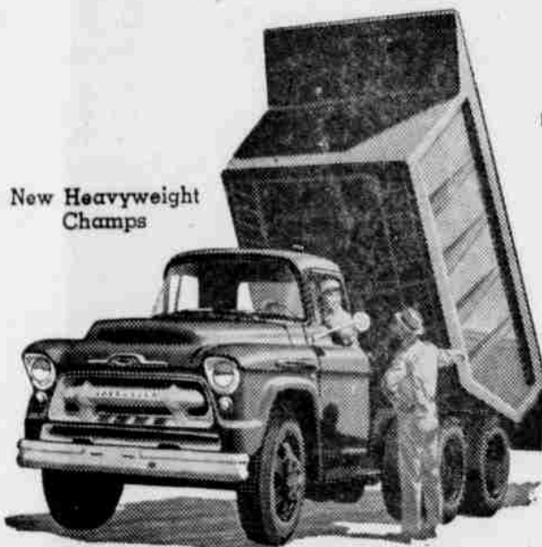
New Heavyweight Champs