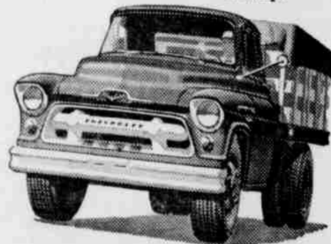
New Middleweight Champs

High-powered V8's—standard in heavy-duty jobs! You get the big new 322-cu.-in. Loadmaster V8 in 9000 and 10000 series trucks. The Taskmaster V8 is standard in other L.C.F. and heavy-duty models. In lightweights and most middleweights, V8's are extra-cost options.