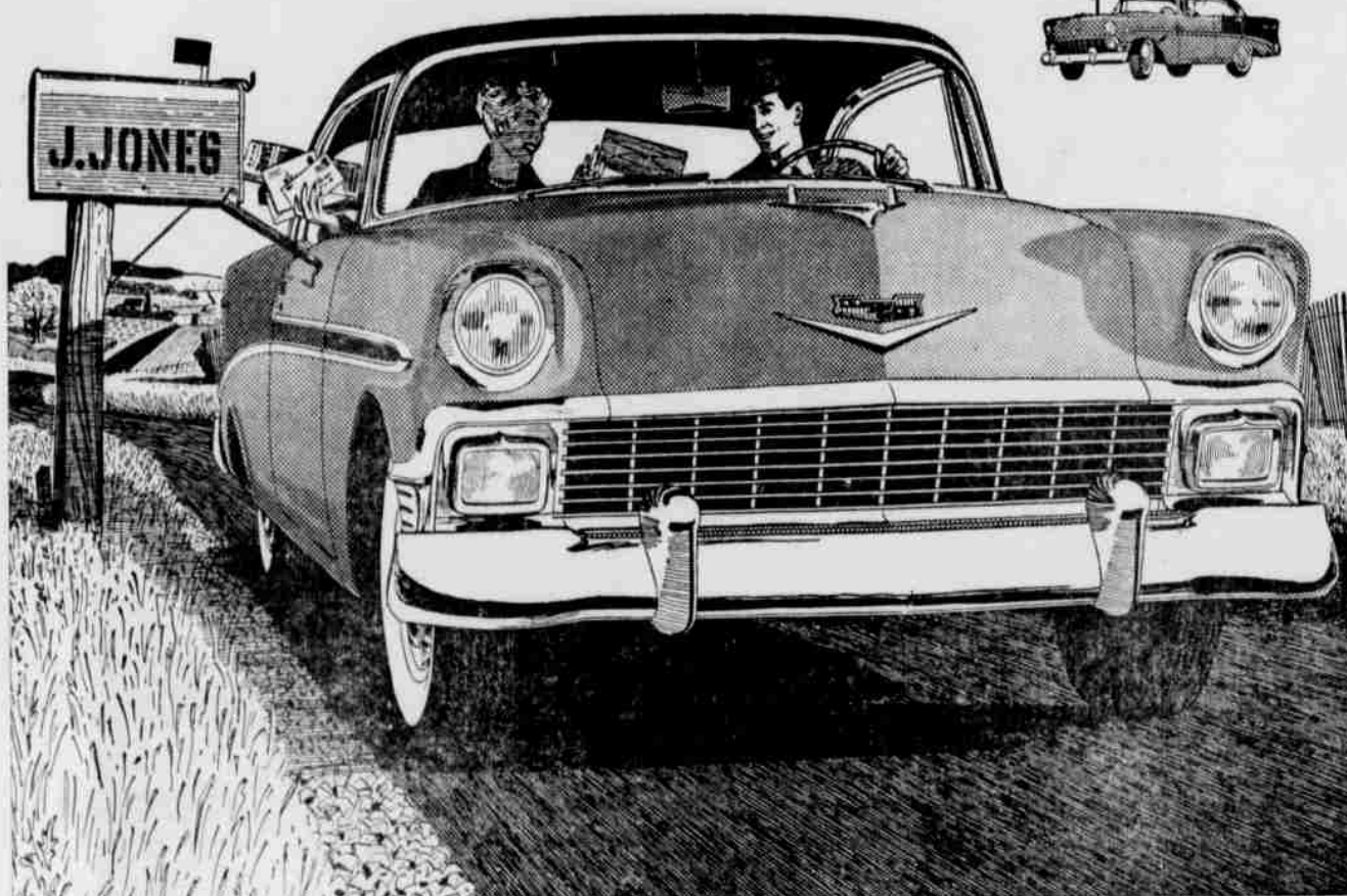
THE NEW BEL AIR SPORT COUPE with body by Fisher—one of 20 frisky new Chevrolet models.