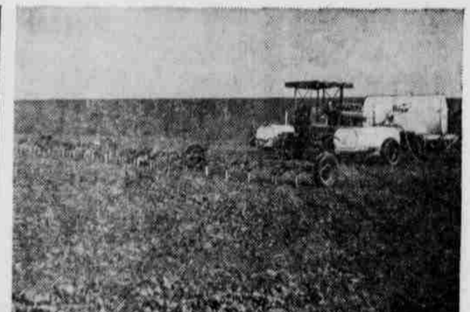
MECHANIZED REFILL cuts applicator loading time and labor 70-80 percent. High-speed transfer pumps do the work faster, better.

Our field-side handling, loading and drill application are fully mechanized. Application tanks are refilled with high-speed transfer pumps which cuts loading time. One man keeps a rig rolling and covers more acreage, more quickly, because this