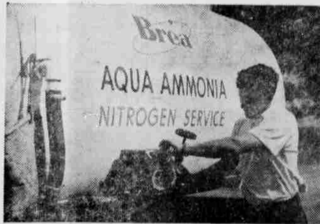
OUR MECHANIZED FIELD-SIDE SERVICE saves you manpower and equipment time on storage, handling, hauling and applicator loading.

GRAIN GROWERS CUT COSTS WITH "NO-LIFT-NO-LUG" NITROGEN SERVICE