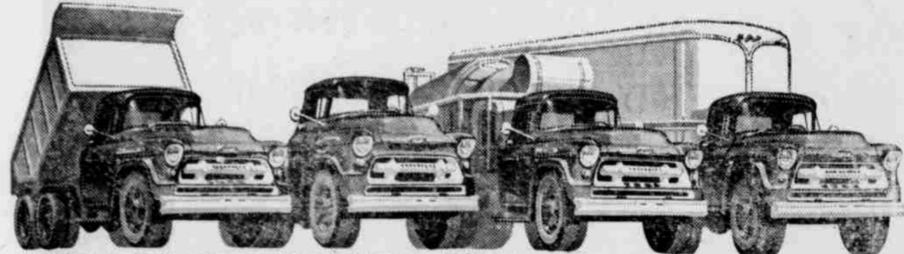
10000 Series truck with tandem. • 9000 Series L.C.F. • 10000 Series truck with mixer. • New 8000 Series model as tractor.