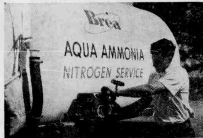
OUR MECHANIZED FIELD-SIDE SERVICE saves you manpower and equipment time on storage, handling, hauling and applicator loading.