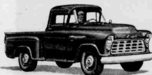
New Lightweight Champs

NOW! BIG, TOUGH TANDEMS! Meet the new heavyweight champs! This new Triple-Torque Tandem is rated up to 32,000 lbs. G.V.W., up to 50,000 lbs. G.C.W.! It's built big to do big jobs! NEW '56 CHEVROLET TASK-FORCE TRUCKS!