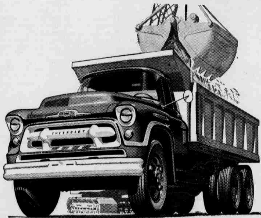
New Heavyweight Champs