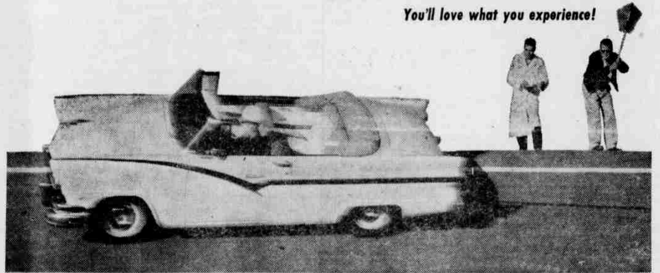
Photographed at world's most modern test track—Ford's new desert proving grounds at Kingman, Arizona.

Discover what happened at the thrilling Kingman, Arizona performance run! Try this Ford yourself... for pick-up... for passing... for hill-leveling! You'll love what you experience!