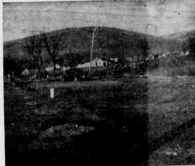
HEPPNER'S CITY PARK is daily looking more like a park as city crews continue to clean and level the two-block long area on north Main street. All buildings have been removed, as have many of the older trees and dirt has been hauled in to fill and level the entire area. Here it is being spread with the city grader. Bids will be called soon for an underground sprinkler system which must be installed before other landscaping work can be done. (GT Photo)

Confirmation instruction will begin next Sunday at All Saints' Episcopal church at 4 p. m. Classes will be held each Sunday afternoon until The Rt. Rev. Lane W. Barton, Bishop of Eastern Oregon makes his visitation April 29.