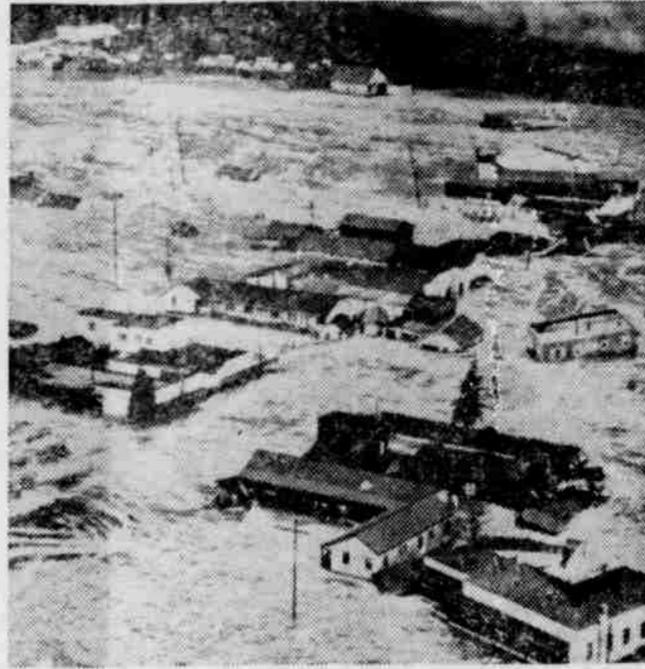
KLAMATH, CALIF.—FIFTEEN FEET of water surges through the business district of Klamath, covering some buildings to the rooftops. About 500 residents of the community were evacuated. The town was one of many in four west coast states hard-hit by flooding. The American Red Cross estimated that it would spend at least $8,000,000 to aid victims of the western states floods.