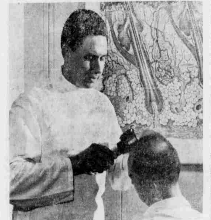
A demonstration of the best known methods of hair and scalp treatments to be given to the citizens of our city.