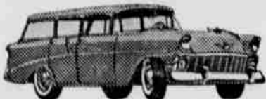
"Two-Ten" Beauville—4 Doors, 9 Passengers

Here's a zippy, exciting kind of power that's fun to handle. And the closest thing to sports car performance—split-second steering reaction and the knack of holding fast around curves—that you'll find in a full-size automobile. Seat belts, with or without shoulder harness, and instrument panel padding, are optional at extra cost. Safety door latches and directional signals are standard. Come in soon and drive a real road car!