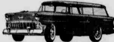
"One-Fifty" Handyman—2 Doors, 6 Passengers