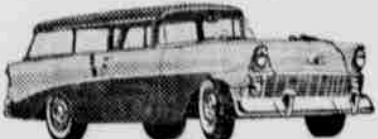
"Two-Ten" Handyman—2 Doors, 6 Passengers