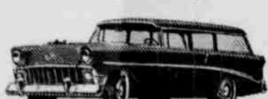
"Two-Ten" Townsman—4 Doors, 6 Passengers