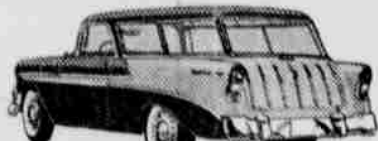
Bel Air Nomad—2 Doors, 6 Passengers