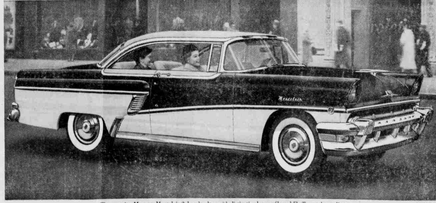
The stunning Mercury Montclair 2-door hardtop with distinctive low profile and Flo-Tone color styling.

Easier riding and handling on sharp turns-new comfort on bumpy roads—widest choice of safety features in its field help explain why THE BIG M is the big buy for 1956.