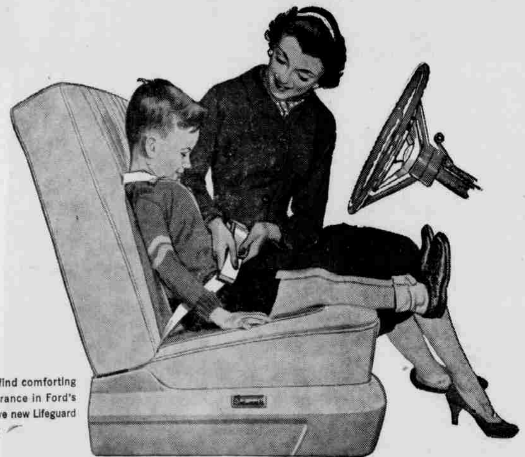
You'll find comforting reassurance in Ford's exclusive new Lifeguard Design.

HEPPNER HARDWARE & ELECTRIC THE LOYAL PARKERS