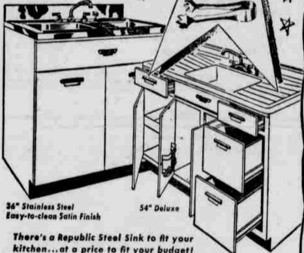
26" Stainless Steel Easy-to-clean Satin Finish