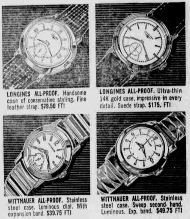
LONGINES ALL-PROOF. Handsome case of conservative styling. Fine leather strap. $79.50 FTI

A perfect gift for an active man—Longines-Wittnauer ALL-PROOF watches give maximum protection. Water*, and dust cannot harm them, main-springs are unbreakable. Balance is rust-proof and anti-magnetic, with improved shock protection. ALL-PROOF models in many styles