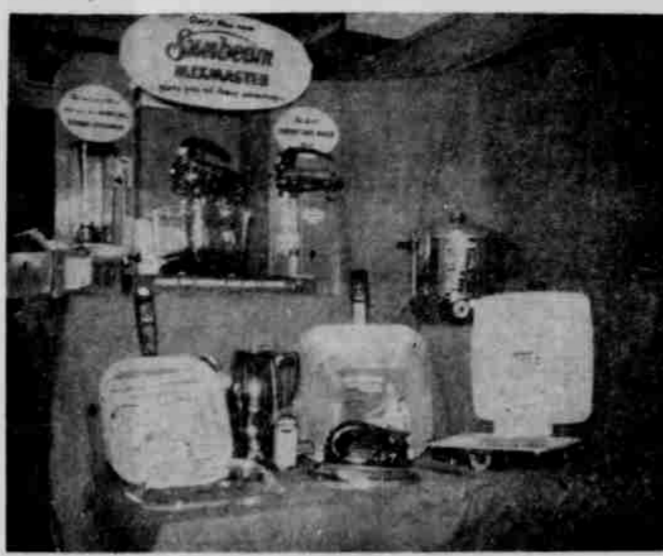
GONTY'S has just put up a special display of Sunbeam gift appliances for the early shopper. Among the many fine gift items are the Sunbeam Mixmaster, electric fry pan, coffee maker, deep fryer and many others. The store also carries a complete selection of popular and classical records and albums.