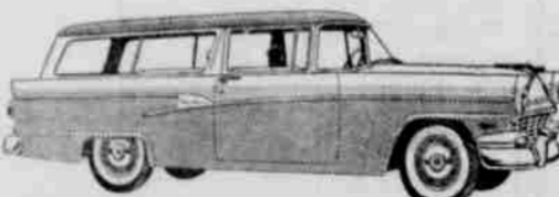
Custom Ranch Wagon

This all-around favorite has two wide doors, easily seats 6 people. As in all Ford Station Wagons, lift gate and tail gate can be operated easily with one hand.