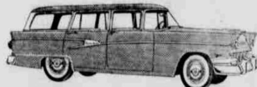
Six-Passenger Country Sedan

It's more stylish than ever this year, with exciting new colors... stunning interiors. Like the Country Squire, it has an easily removable 2-section rear seat. Four doors give easy access for all eight passengers.