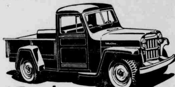
Now available with power brakes.