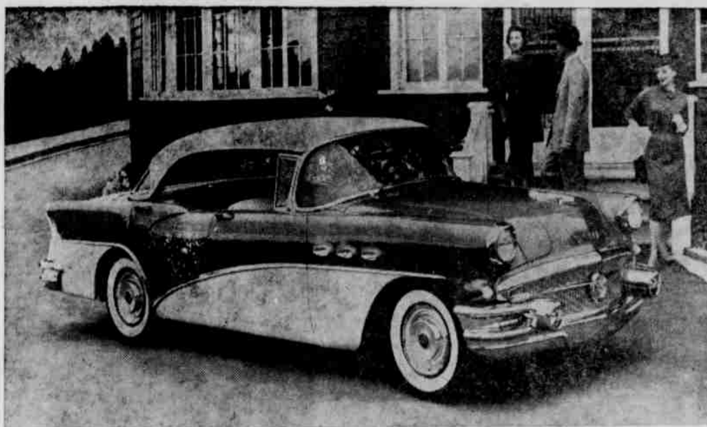
Big car luxury and performance are combined in Buick's medium priced four-door hardtop sedan in the Special series. Powered by a 322 cubic inch, 220 horsepower engine, the Special boasts one of the biggest power plants of any car in its class. All the beauty of Buick's distinctive styling, including the new front end, full rear wheel cutouts and luxurious interiors are featured on the Special series. Dynaflo, power steering, power brakes and dual exhausts are optional on the Special.

Both groups spent the evening watching movies. Refreshments were served later.