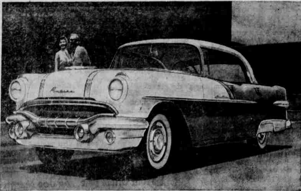
PONTIAC OFFERS NEW FOUR-DOOR HARDTOP FOR 1956 — Exciting news in Pontiac's beautiful new line of 1956 automobiles is the Star Chief Custom Four-Door Catalina Sedan. The fleet, luxurious model, finished in custom colors with matching leather and nylon fabric interiors, rides on a road-leveling 124 inch wheelbase. Its new, larger 227 h.p. Strato-Streak V-8 engine and the revolutionary new Strato-Flight Hydra-Matic transmission makes the car the smoothest handling, most powerful ever produced by Pontiac. In 1956, Pontiac offers the popular four-door hardtop sedan in all series.