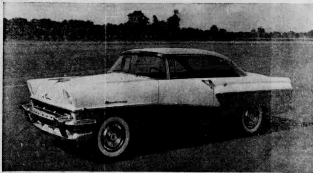
Bigger in performance, power and appearance, this new 1956 Mercury Monterey coupe emphasizes the lower silhouette of the entire line of Mercurys for 1956. With 13 models in three series—Montclair, Monterey and Custom—Mercury offers an impressive variety of color and fabric combinations. A new Mercury Safety-Surge V-8 engine with 312 cubic inch displacement further enhances Mercury's acceleration and power throughout all the driving range.