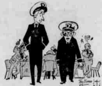
"IF YOU CAN KEEP YOUR HEAD WHEN ALL ABOUT YOU ARE LOSING THEIRS... MAYBE YOU DON'T FULLY UNDERSTAND THE SITUATION"