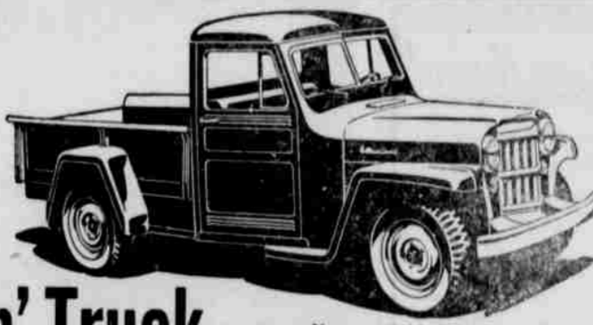
Now available with power brakes.