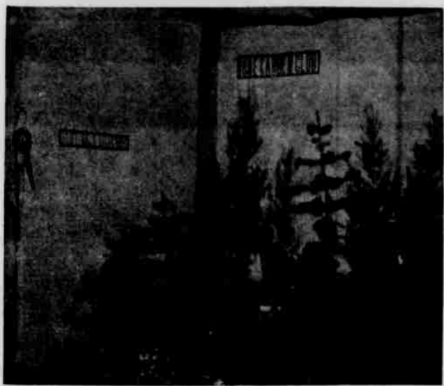
BLUE RIBBON WINNER in the organization booth division at the fair was this entry of the Ione Garden club prepared around the theme "Don't be a Litterbug." The booth showed the difference between a well kept public park and one used by litterbugs.