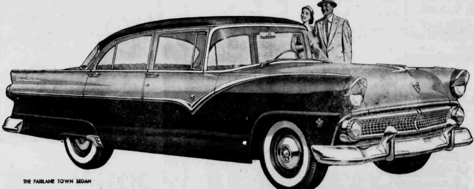
THE FAIRLANE TOWN SEDAN