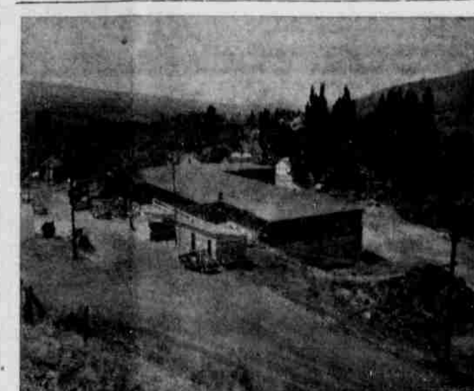
NEW HEPPNER GRADE SCHOOL is rapidly taking shape as carpenters and brick layers have nearly completed the outside of the 10 classroom and multipurpose room building. This photo shows the new plant from the vantage point of hospital hill. Entrances are on the street side with the rooms opening out to the north side of the building facing Hinton creek. Simonton and Steel, Portland contractors are doing the construction.