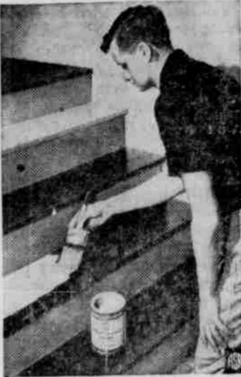
PAINT ALTERNATE STEPS to keep stairways usable while they are being painted. Finish the job when the steps painted first are dry.

"For example," Steudel said, "you don't have to get down on your hands and knees to paint a floor nowadays. Thanks to a new long-handled paint roller, you can