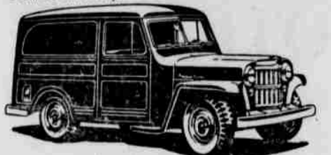
The 'Jeep' Sedan Delivery... ideal for delivery or service use.