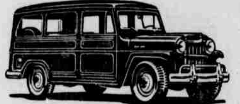
The 'Jeep' Station Wagon... dual purpose vehicle for business and family.