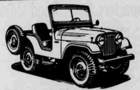
The Universal 'Jeep'... does hundreds of jobs.