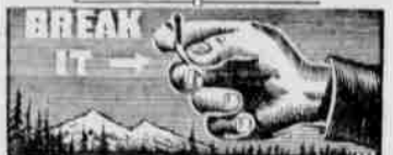
KEEP OREGON GREEN