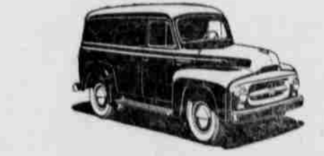
PANELS. R-110 Series. 115-inch wheelbase. Loadspace dimensions: Length 90 inches, width 60 inches, height 54 inches. Rear doors open to 90 or 180 degree position.