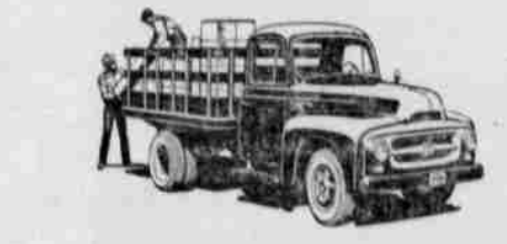
STAKES. R-110 Series. Heavy 7/8-inch oak floor. Side and end racks 3/4-in. kiln-dried hardwood. Sturdy steel stakes easily removable for flat-bed operation.

If your work calls for a 1/2-ton pickup, panel or stake truck, we've got the right truck to keep your costs way down. From any angle, INTERNATIONAL is your best truck buy. The new economy Silver Diamond engine is built to keep operating and maintenance costs at a minimum. Take Comfort. The Comfo-Vision cab has plenty of head, leg and shoulder room, cushioned comfort for the biggest drivers. Take Performance. When you drive it you'll know what 1/2-ton truck performance should really be like! All models have tubeless tires standard, with power steering, automatic transmission, or overdrive at extra cost. Take an eye-opening drive, today!