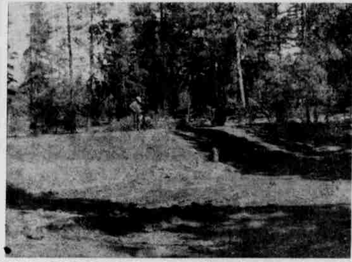
WATER STORAGE PONDS —which will provide water for wildlife and range animals is another function of the Forest Service. Shown in this Forest Service photo is one of the numerous earth fill dams which have been built within the Heppner district to impound water for use during the dry summer months. Conservation of water is important in this section of the state.

and the results of the districts' efforts can be seen on every hand. Wildlife preservation, forest fire prevention and the following points have been given special attention during the week: