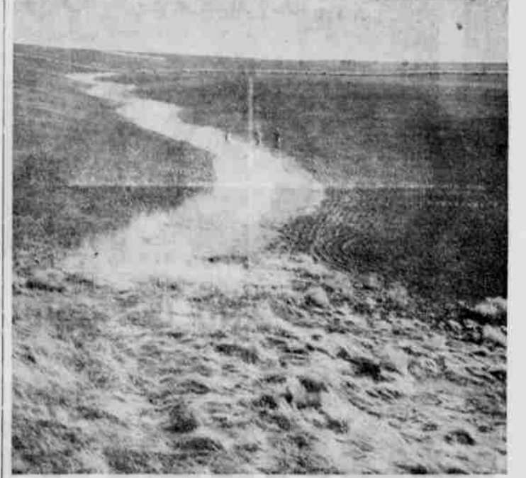
SOD WATERWAYS help to prevent soil loss during heavy rains as the heavy grass tends to bind the soil and keep it from washing. Such practices are promoted by the Heppner Soil Conservation district.