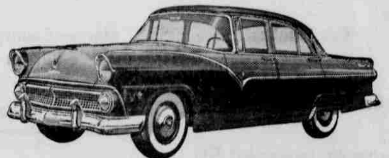
VACATION IDEA... VISIT FORD ROTUNDA, SHOW PLACE OF THE AUTO INDUSTRY, DEARBORN, MICHIGAN

*Based on manufacturer's suggested list price.