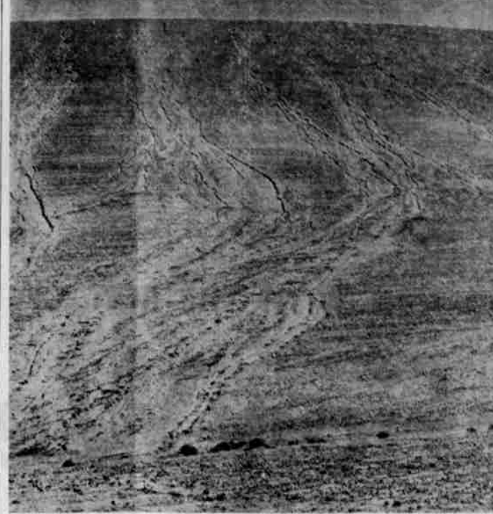
HEAVY SOIL LOSS due to rains of near-cloudburst proportions is illustrated in this Heppner Soil Conservation district photo. On steep hillsides many thousands of tons of soil can be lost in a single storm when the land lies unprotected. This picture was taken following a summer storm two years ago.