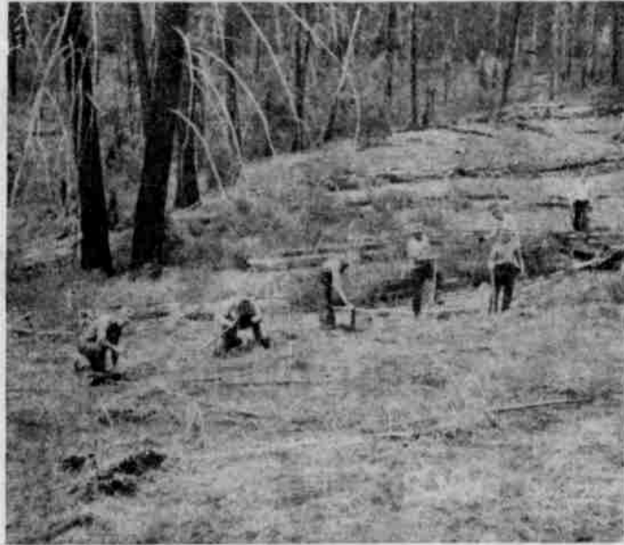
REPLANTING OF FOREST AREAS where fires have destroyed the timber crop is a part of the Conservation Week program now being promoted. Shown here is a crew of workers in the Heppner Forest District setting out small pine trees in a burn in the Blue Mountains near here

One of the most interesting activities of the observance here is the display of all forms of conservation work and its effects which has been placed in the lobby of the First National Bank in Heppner. It depicts graphically the value of soil-saving practices, best use of water to conserve the meager supply, the wise cutting of timber by lumber mills and proper forest management as practiced by the Forest Service. Wildlife too, are shown as is the effect on small pine trees of the activities of porcupines, who do nothing to conserve our timber and are the object of annual contests aimed at their eventual extinction. The display has been viewed by many hundreds of persons during the past week and has brought forth numerous congratulatory com-