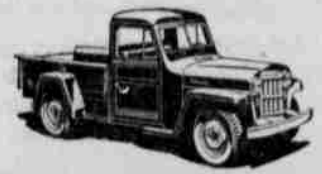
4-WHEEL-DRIVE WILLYS TRUCK

WILLYS—WORLD'S LARGEST MAKER OF 4-WHEEL-DRIVE UTILITY VEHICLES