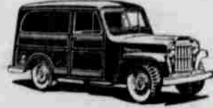
4-WHEEL-DRIVE WILLYS SEDAN DELIVERY