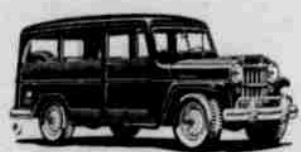
4-WHEEL-DRIVE WILLYS STATION WAGON