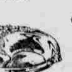
Stradivari Compote. Delicate leaf tracery adorns the edge of this slender compote.

Lovely Valentine gifts at longed-for prices! See them today!