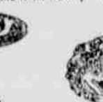
What could be more fitting for Valentine's Day than this beautiful Grande Baroque "Sweet-heart" Dish.