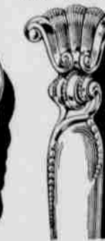
Romance of the Sea