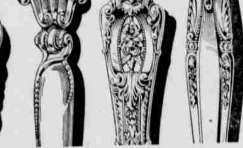
Pick a piece or a place setting—all available for immediate delivery!

Beautiful sterling holloware—every piece imaginable in a range of gift prices. We even have Wallace Sterling holloware to match the "Third Dimension Beauty" flatware.