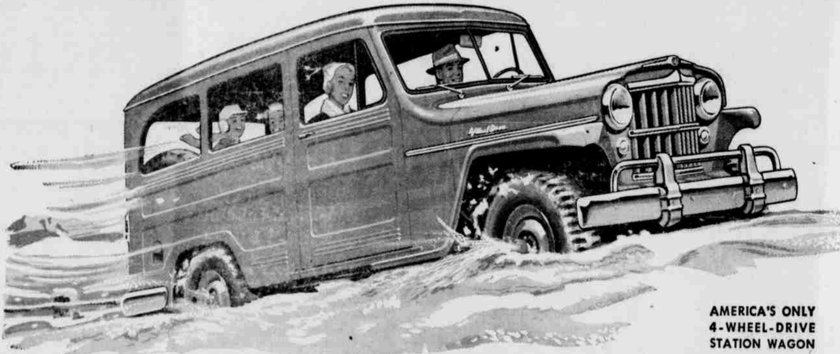
AMERICA'S ONLY 4-WHEEL-DRIVE STATION WAGON

THIS WINTER DON'T BE STOPPED BY BAD WEATHER... GET A 1955