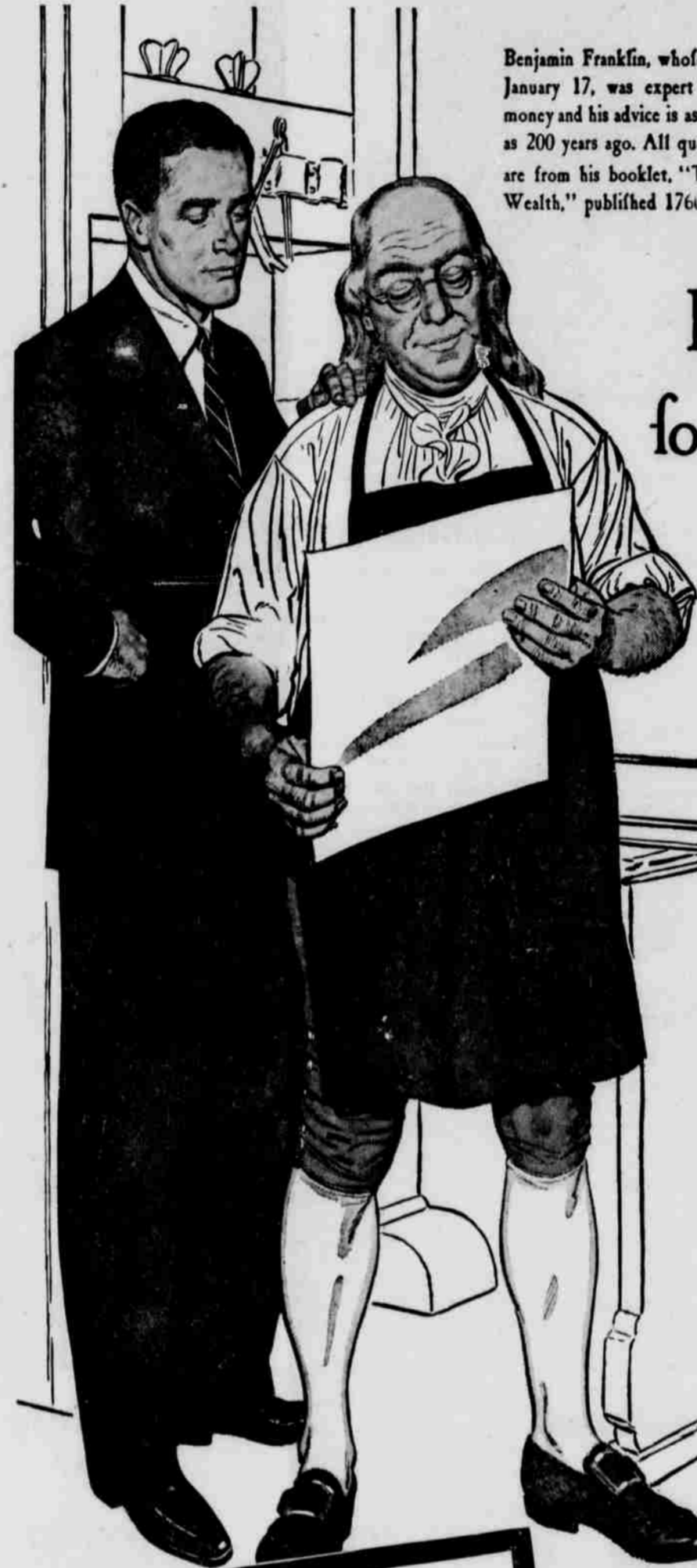
Benjamin Franklin, whose birthday is January 17, was expert in handling money and his advice is as found today as 200 years ago. All quotations here are from his booklet, "The Way To Wealth," published 1760.

For the first time in five years the Hehisch will have printed pictures in their paper. Stencils are made from the pictures and they are run off on the mimeograph machine.