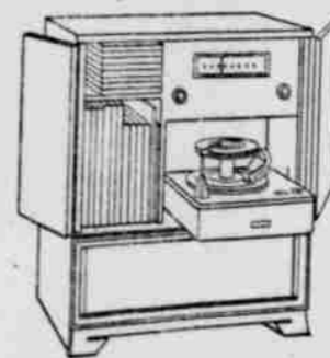
"Victrola" 3-speed automatic phonograph has new Slip-On spindle. Plays all records easier, better.

Now you can enjoy the superb styling, the incomparable quality of an RCA Victor radio-phonograph combination at the year's easiest-to-buy price.