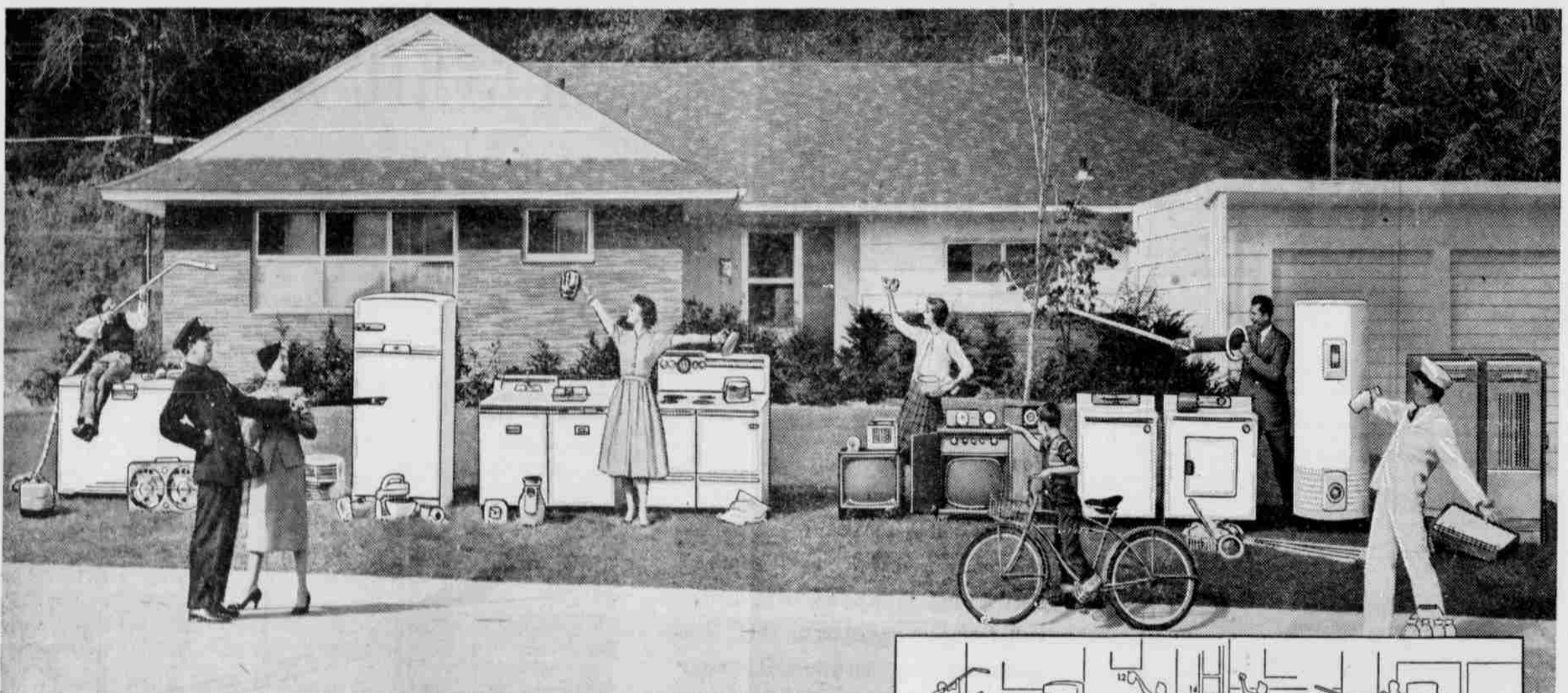
These 30 everyday General Electric appliances lined up on the front lawn dramatize the impact of low-cost electricity on American life. Per capita use of electricity in U.S. is 2 times Britain's, 5 times Russia's, 167 times India's.

An average U. S. family uses enough power each day to equal the energy output of 35 hard-working men