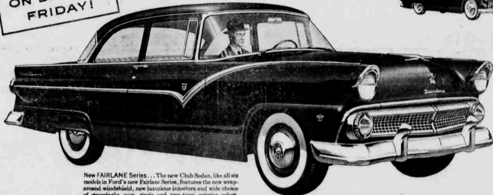
New FAIRLANE Series... The new Club Sedan, like all six models in Ford's new Fairlane Series, features the new wrap-around windshield, new luxurious interiors and wide choice of stunningly new, single and two-tone exterior colors.

Longest, Lowest, Roomiest...most Powerful ever built!