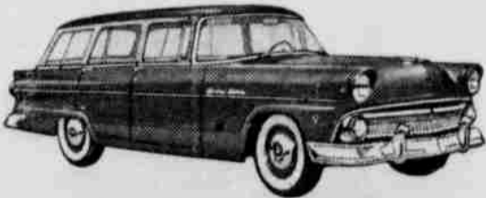
New STATION WAGON Series... The new 6-passenger, 4-door Country Sedan (above) is one of five new do-it-all beauties. There's also an 8-passenger Country Sedan, an 8-passenger Country Squire and a 2-door, 6-passenger Ranch Wagon and Custom Ranch Wagon.