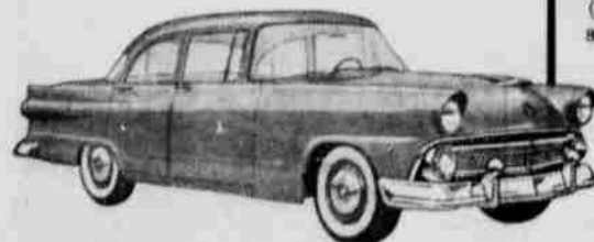
New MAINLINE Series... Each of the three Mainline beauties offers the same engineering advancements, the same graceful contours and clean lines that distinguish all '55 Fords. Fordor Sedan is illustrated above.