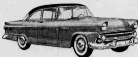
New CUSTOMLINE Series... The Tudor Sedan (above) and Fordor offer a wide selection of new color and upholstery combinations. Like all '55 Fords, they have a new wider grille, new visored headlights and sturdier, extra-narrow pillar-posts for better visibility.

When you come in, don't be surprised if you tell yourself: why look farther—why delay—you just can't buy better than Ford.