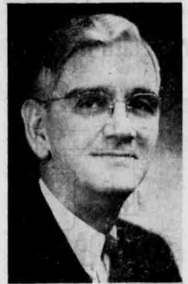
Governor PAUL PATTERSON for Governor