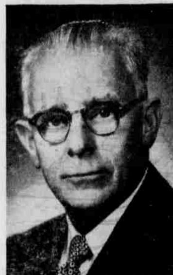
Senator GUY CORDON for United States Senator

And Many More! Keep Them Going as a Team!