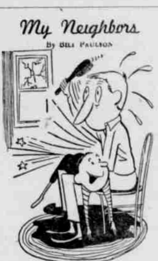
"Gently, sir You know how hard it is to come by a bona fide tax exemption!"