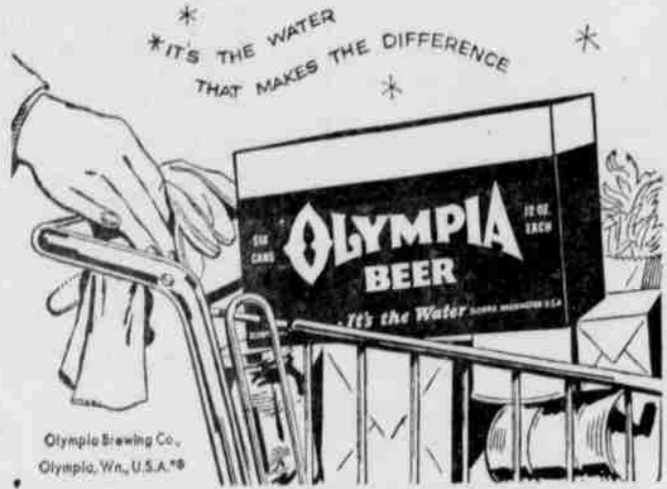
Olympia Brewing Co., Olympia, Wn., U.S.A. '98

Memorable meals begin at the market. For good taste at supper, tonight... choose refreshing Olympia Beer, today.