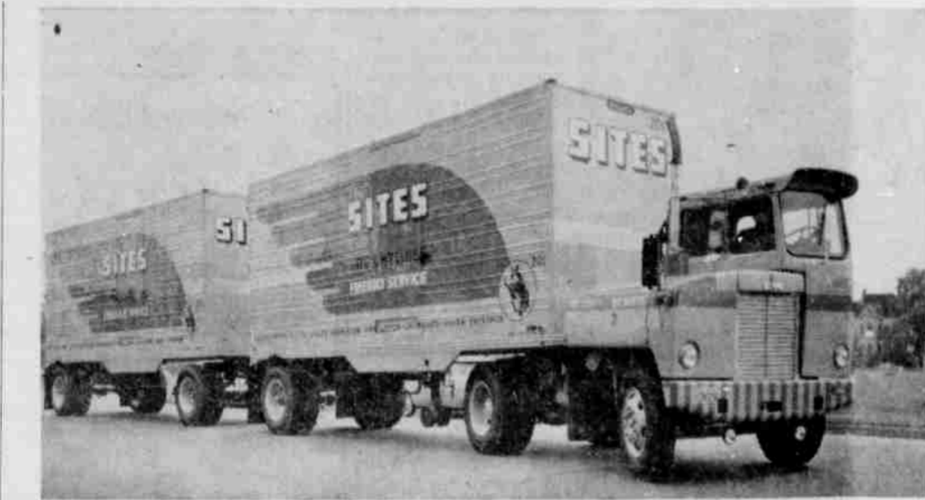
THIS NEW highway combination being put into service by Sites Freightlines (formerly Portland-Pendleton) is the last word in motor transport equip-