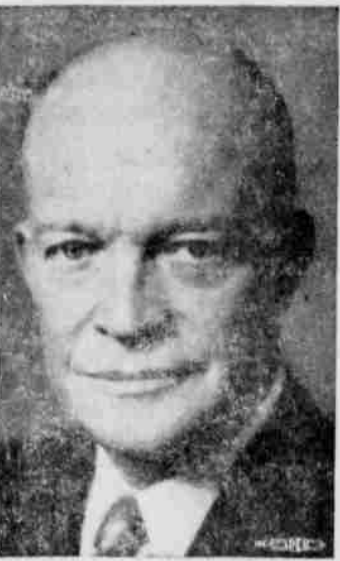
PRESIDENT EISENHOWER will give the main address at the dedication ceremonies at McNary dam next Thursday morning.

President Eisenhower will arrive in Walla Walla Wednesday night by plane, staying overnight in the Washington city. He and his party will travel by motorcade to the dam Thursday morning just prior to his part in the program. Following his speech, he will leave immediately for Pendleton where his plane will be waiting to return him to Washington.