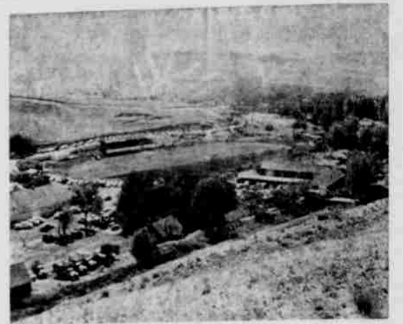
MORROW COUNTY FAIR GROUNDS showing the rodeo field and some of the fair buildings that will hold one of the largest collections of exhibits ever to be presented at the fair.

He showed slides of different weather conditions and told that the company had been doing some work with hail as well as