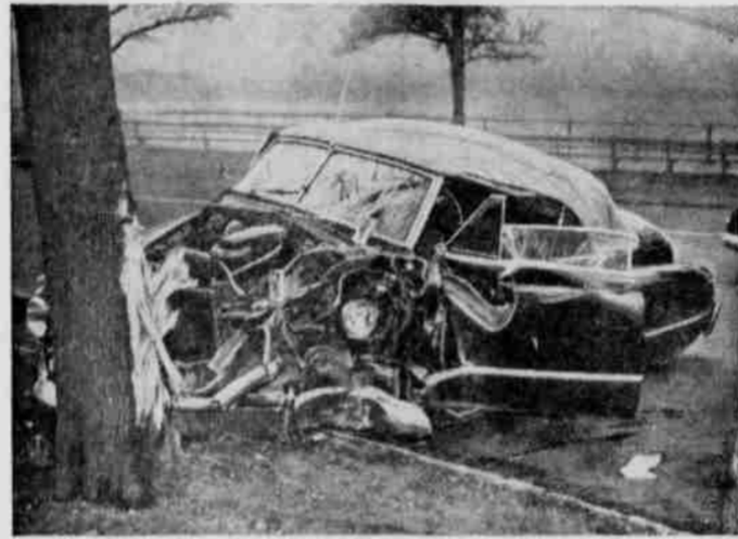
The operator of this modern automobile traveling probably four times as fast, lost his life. If you're sitting in the driver's seat on that coming Labor Day trip, the accident prevention department of Employers Mutuals of Wausau reminds you that excessive speed and sudden death go hand-in-hand: You should observe not only the legal speed limit, but the limit set by road, traffic and weather conditions . . . because any speed can be a killing speed, depending upon the circumstances.